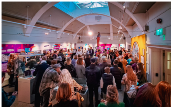
Bowie and Beyond

At Kingston Museum , you can see bootleg vinyl recording of David Bowie, live from Kingston Polytechnic on 7 May 1972 – just a few months after Bowie had first unveiled his Ziggy Stardust alter ego at The Toby Jug pub in nearby Tolworth. At Stanley Picker Gallery , you can see a Hall of Fame of alumni from the prestigious School of Art.